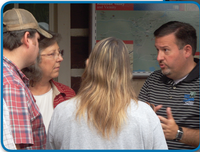
Roanoke County staff split up into seven tables to talk about future opportunities at the park: Hiking/Biking, Economic Development, History, Programs, Events, Accommodations and Riverfront.