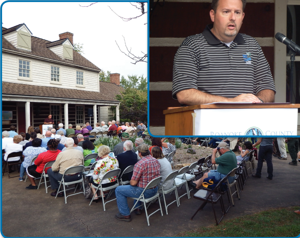
Residents packed the plaza outside Explore Park's Arthur Taubman Center