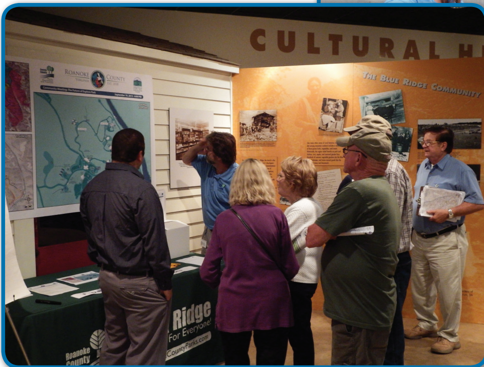
Staff stayed on hand for three hours, until all citizens had a chance to provide input about the park's future.